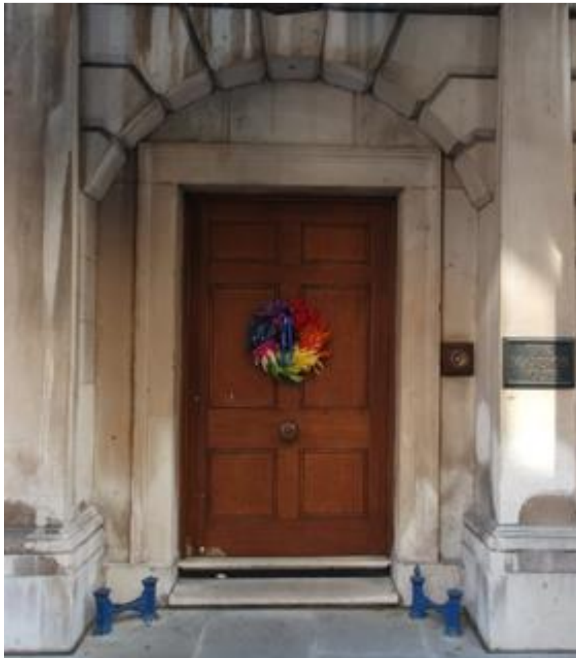
The rainbow wreath on the door of the Mansion House to show support for the NHS and key workers