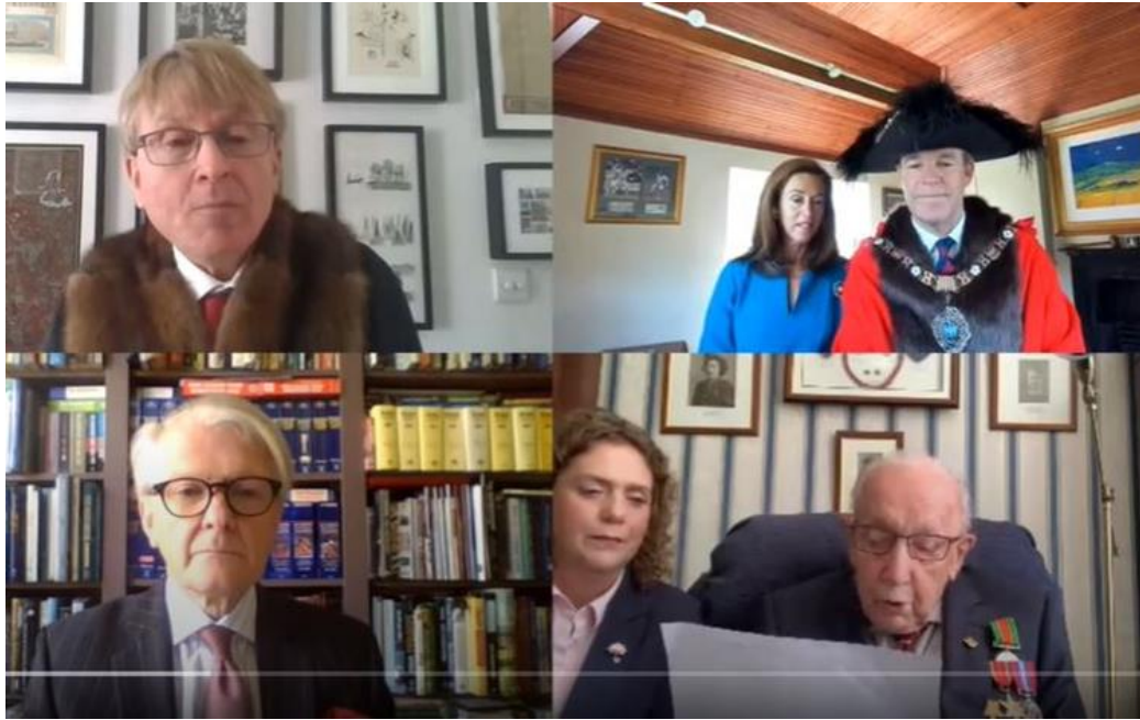
Captain Tom Moore reads the Declaration of a Freeman of London in an online ceremony in May 2020