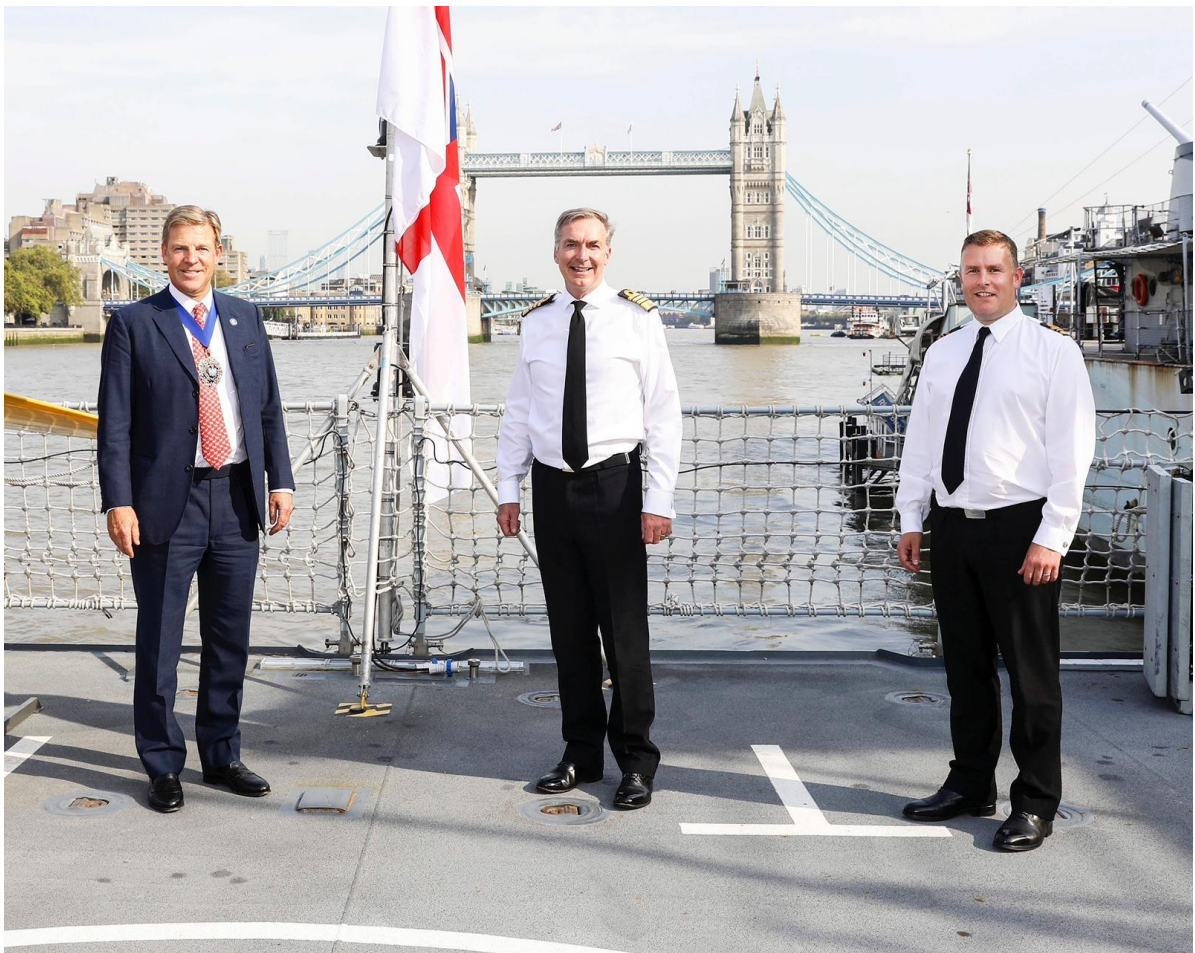
With the First Sea Lord, welcoming HMS Tamar, the Royal Navy's newest warship, to London.