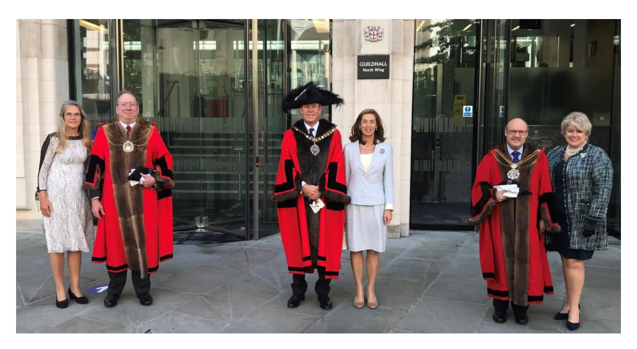
The Lord Mayor, with the Lady Mayoress, the Sheriffs and their Consorts, following Common Hall at Guildhall on 30 September.